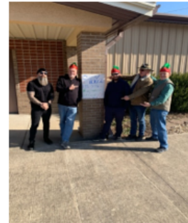
Table Rock Lodge 680 and the Kimberling Chapter 164 of the O.E.S. participated in the annual Open House this year. We received over 200 guests this year, which ranged in age from the very young to the very old. It was a good opportunity to let the public know about what our chapter is up to.